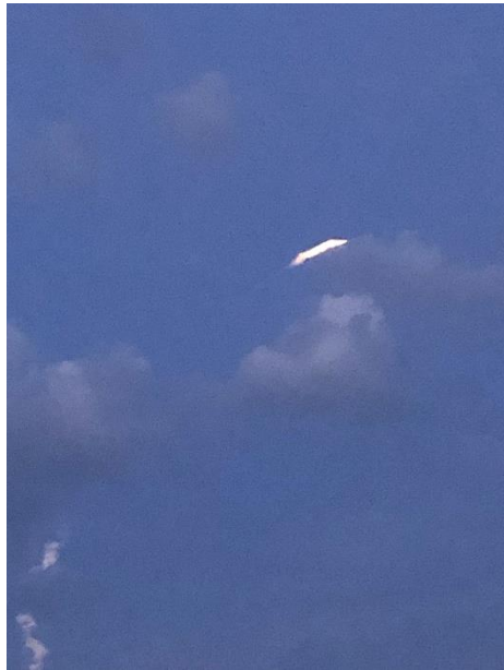
June Launch captured over Legacy Pointe